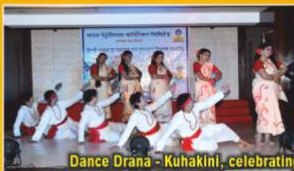
Dance Drana - Kuhakini, celebrating 'HINDI DIWAS' with BPCL, Mumbai