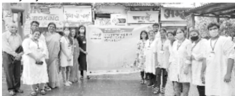
Swaccha Bharat Abhiyan project at Bhandup Station Road