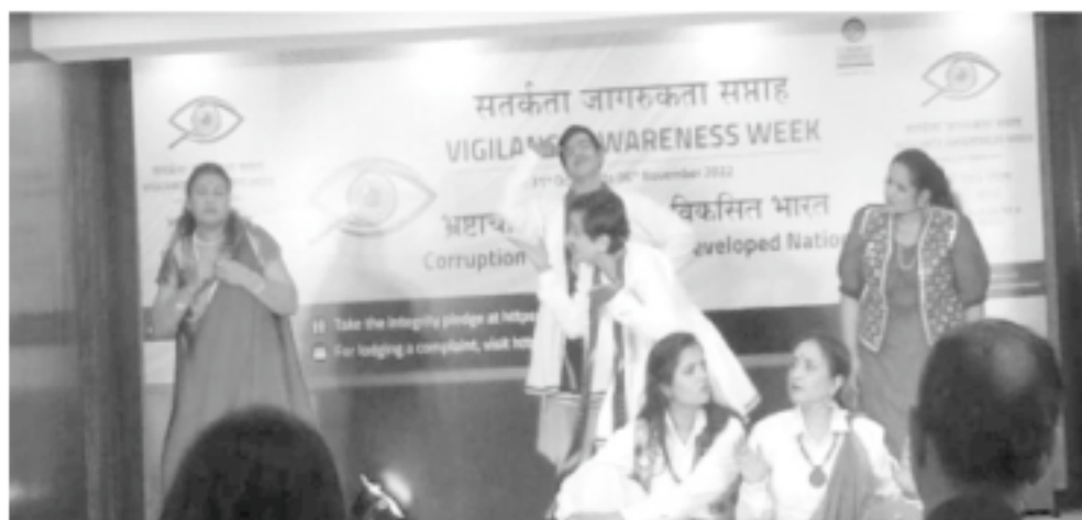
Nriyanjali artistes presenting a Skit on Vigilance awareness celebrating Vigilance Awareness Week with Bharat Petroleum Corporation Limited , Mumbai Head Office, Mumbai

Rhinos use their horns for several purposes like defending territories, protecting their calves from other rhinos and predators, digging for water and breaking branches . Female rhinos use their horns to guide their young till they are capable of navigating on their own