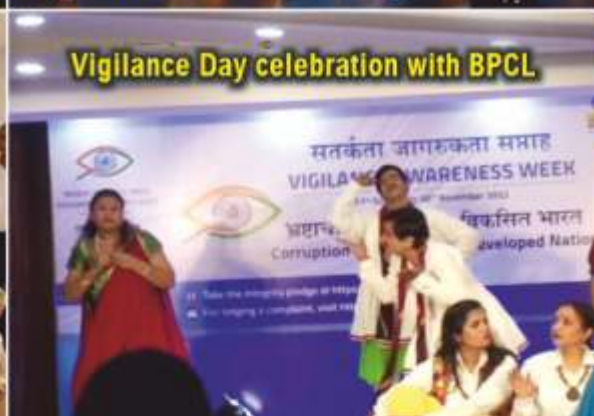
Vigilance Day celebration with BPCL