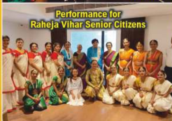
Performance for Raheja Vihar Senior Citizens