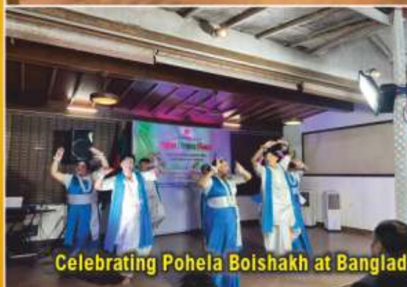
Celebrating Pohela Boishakh at Bangladesh Dy. High Commission office_Mumbai