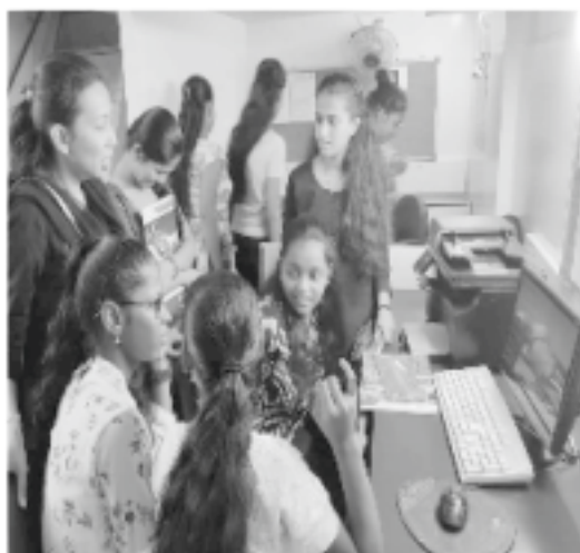
Students learning Computers at Nriyjanali, Bhandup

platforms created by the organization for the betterment of mankind and one among them was Unnat Yuvati, a project for the betterment of less privileged Girl children of Grade 10th, belonging to Marathi medium School.