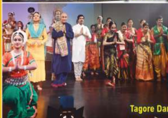
Tagore Dance at NCPA